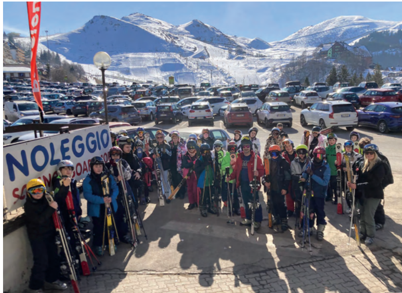
Finham Park 2 Ski Trip to the Italian Alps February 2023

The opportunities available at Finham Park 2 outside the classroom ensures that absolutely no one is left out. There is something for everyone - for example; chess tournaments, creative writing, school productions, ukulele, 'Grub Club' and Maths Challenge, as well as homework club, sport training and matches and extra tuition. The Finham Park MAT World Class Guarantee ensures that all students are offered the opportunity of national and international visits including trips to sports fixtures, the coast, theatres and art galleries.